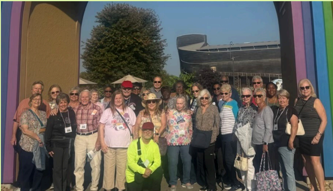
Garden City Senior Center group

In September, twenty-eight patrons from the Garden City Senior Center traveled to Williamstown, Kentucky to visit the Ark Encounter . Opening in 2016, the Christian Theme Park is a home of a handful of attractions, but the centerpiece of the park is a life-size replica of Noah's Ark built according to the dimensions given in the Bible. At 510 feet long, 51 feet high, and 85 feet wide (converted to modern measurements), the structure houses three decks of world-class exhibits, illustrating what life aboard the ark may have been like. What an amazing and enjoyable trip!