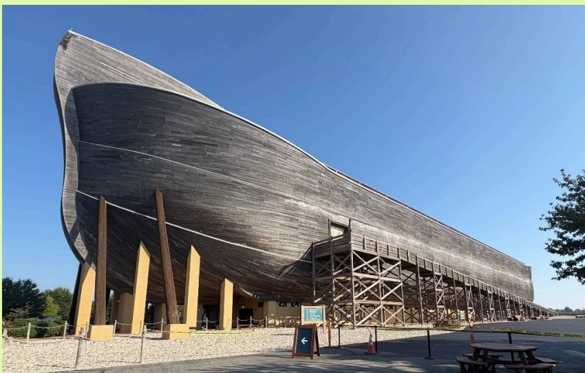
Noah's Ark replica